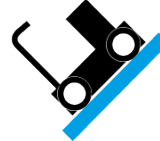
Welding with a slope <math><45^\circ</math>